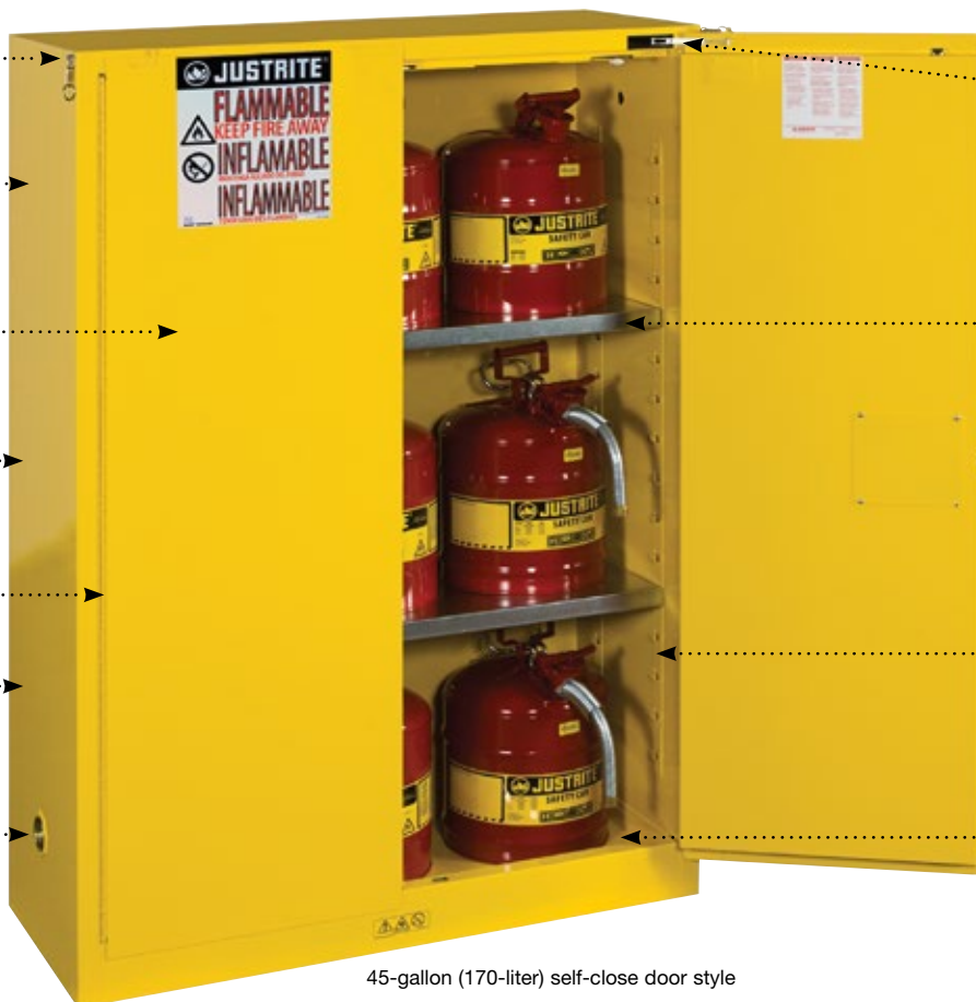
45-gallon (170-liter) self-close door style

Dual vents with built-in flash arresters strategically placed at bottom and opposite top.